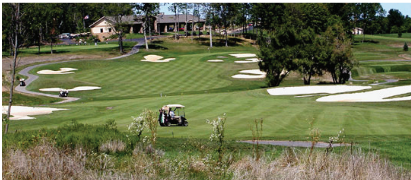
Ravenwood's 18th Hole: Pictured Above